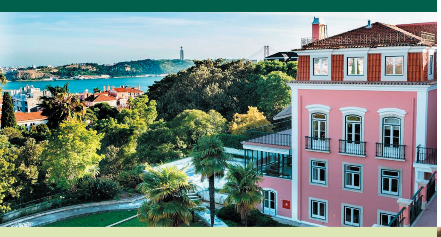
FLAD/SiPN Headquarters in Lisbon

Study in Portugal Network (SiPN) is a specialized study abroad provider based in Lisbon, Portugal, created and managed by the Luso-American Development Foundation (FLAD) – a major Portuguese Foundation whose mission is to promote the development of Portugal through bilateral relations with the United States. SiPN is a multi-university consortium of Lisbon-based universities: ISCTE-Instituto Universitário de Lisboa, Universidade Católica Portuguesa, Universidade de Lisboa and Universidade Nova de Lisboa that aims to attract and support students and faculty from the United States to come to Portugal on various study abroad experiences. Since 2016, SiPN also established a summer program in partnership with the University of the Azores.